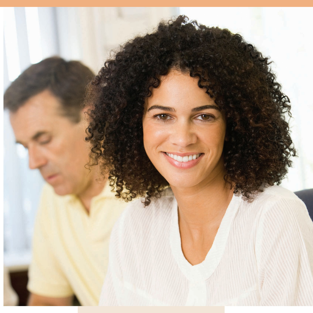
By the Editors of Kiplinger's Personal Finance